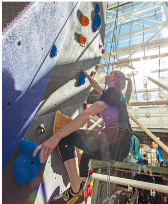
Scale our 16 m climbing wall, the tallest on any Canadian university campus.