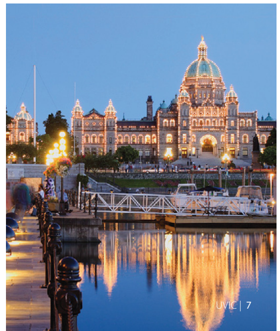
Visit the downtown inner harbour, where you'll find the Parliament Buildings illuminated at night.