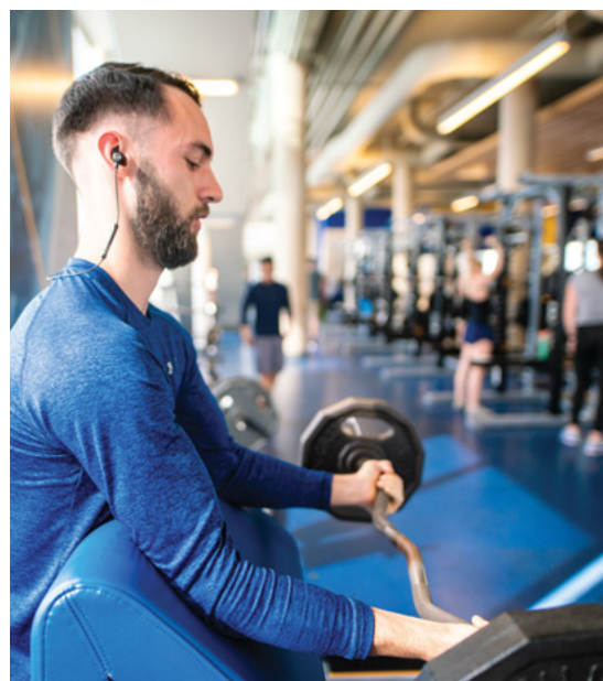
Get your heart pumping in CARSA's two-level fitness and weight centre. Below: Take your game to championship level on a Vikes Varsity team.