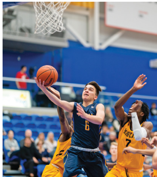
Play for the Vikes varsity basketball team (men's or women's) or choose from seven other varsity sports.