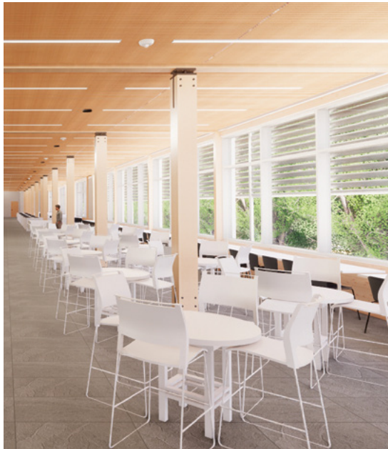
Dining room in new residence facility. Below: Shared kitchen in a Cluster unit