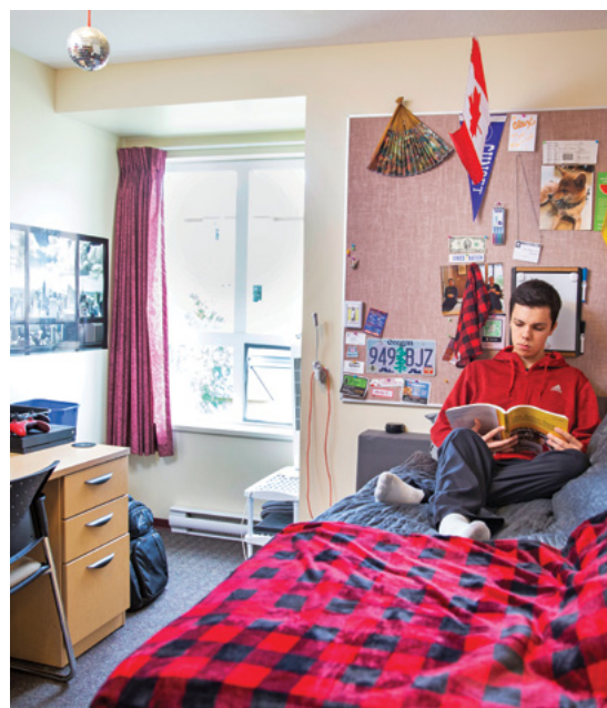
Single room. Below: Enjoy your favourite foods on campus.