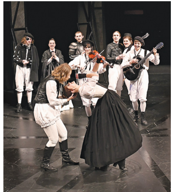
A full cast of actors, chorus members and musicians perform Othello at UVic's Phoenix Theatre.